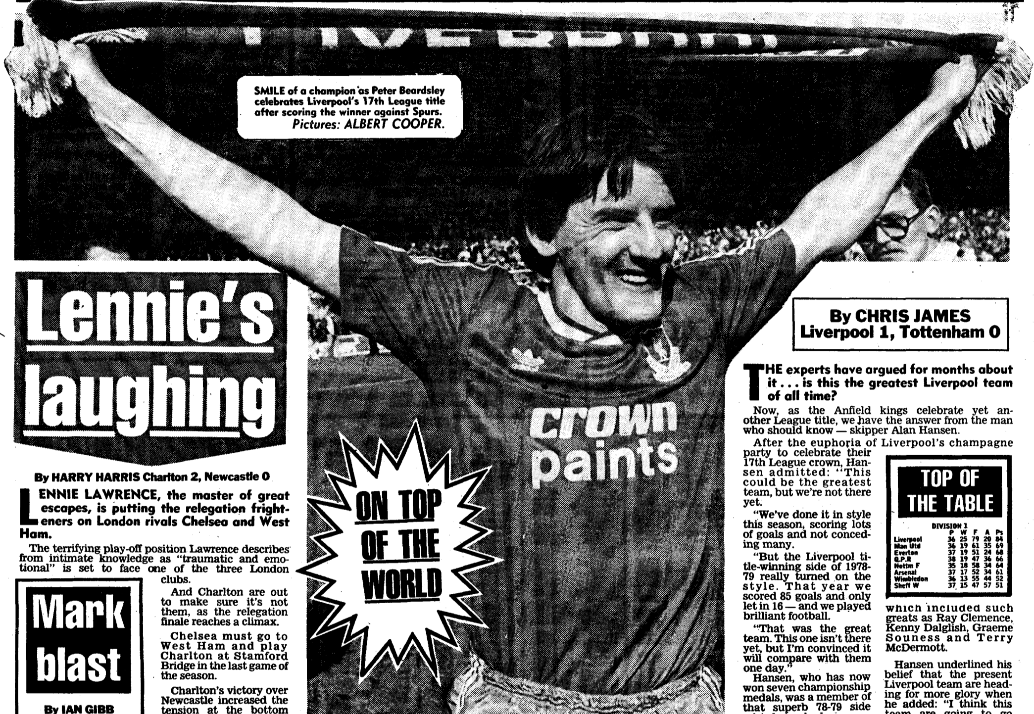
SMILE of a champion as Peter Beardsley celebrates Liverpool's 17th League title after scoring the winner against Spurs.