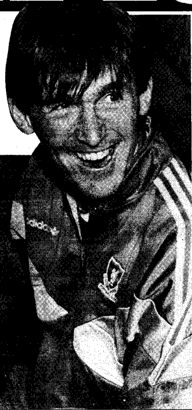
Kenny Dalglish opens the bubbly and allows himself a rare smile as he savours Liverpool's triumph.